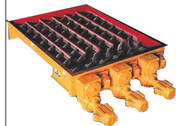
Shaftless Screw Live Bottom